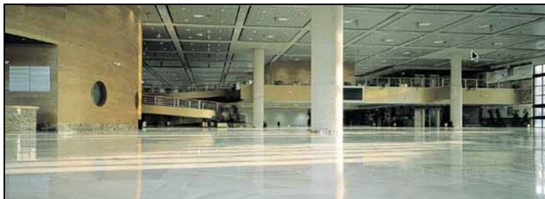
>> View of the exhibition area of the Palacio de Congresos of Granada

At the hall of the Palacio de Congresos , where the conference sessions will take place, there will be space for the exhibition. From Wednesday 12th to Friday 14th July the devices will be placed inside the building, and no practical demonstration can be performed.